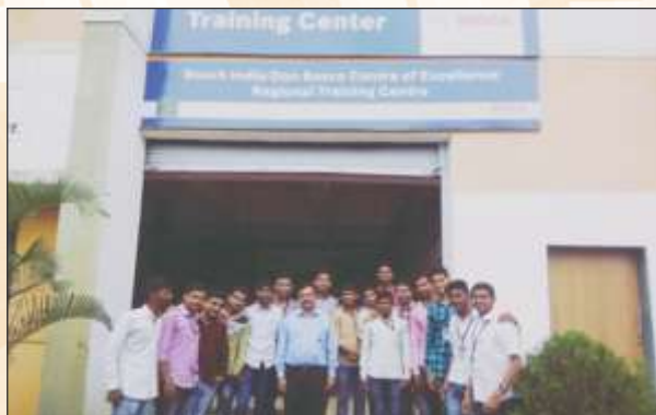
21 Students have participated in the Industrial Training Programme at Bosch India Ltd.