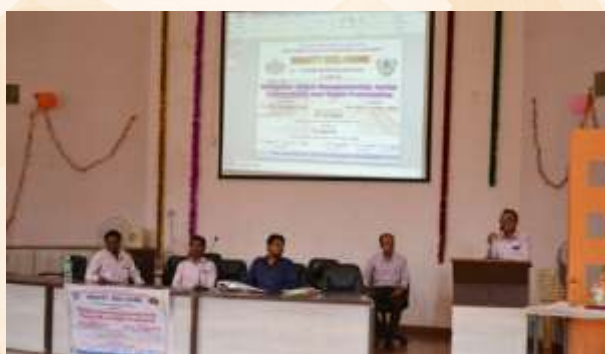
Two days Short term course CAM using Feature CAM & RP