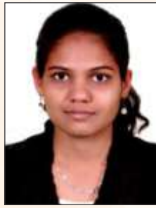
Badakh Shweta Dhoot Transmission Pvt. Ltd