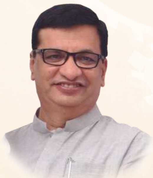
Hon. Shri. Balasaheb Throrat President