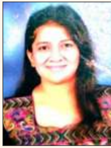
Karpe Nilam Dhoot Transmission Pvt. Ltd