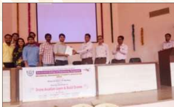
A one day workshop on "Drone – Build & Fly"