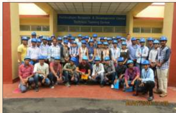
43 students have participated in the Industrial Training Programme at Reliance Thermal Power Plant (DTPS)